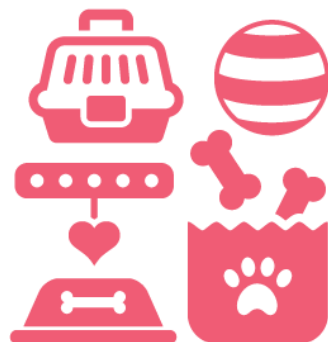
ASSORTMENT AND VALUE

Over $800 million in annual Services sales