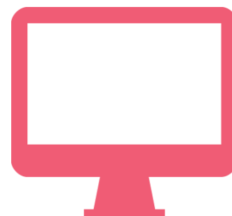
OMNI AND DIGITAL MEDIA

Over 11,000 in-store products, many are exclusive or proprietary