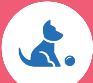
DOGGIE DAY CAMP